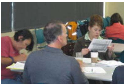
The participants were good students!

CIS staff will be following up with training participants over the next few months to offer technical assistance as they work to adopt evidence-based practices or programs. Feedback indicated that participants appreciated the